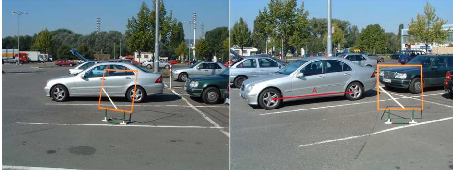
Fig. 2: Application example, measuring the wheel base of the car (A).

User interaction is inevitable, in-place as well as during postprocessing with a computer. But here, in-place user interaction is nothing more than placing the reference quadrangle within the scene (when not using a "natural" quadrangle) and taking two or more pictures from different vantage points. Thus, it seems to be close to minimal. The postprocessing step comprises the selection of image points, namely the corner points of the reference quadrangle and the points to reconstruct (fig. 2: wheel centers). For a reference quadrangle being placed by hand, an automatic detection of the corner points with sub-pixel accuracy is intended, but not realized yet. In terms of simplicity, there should be as few as possible reference points. But, using a triangle as reference figure would lead to a system of nonlinear equations when doing the monocular reconstruction (see [4]). These could be solved, but not as stable and robust as performed here.