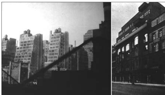
Fig. 4: View from a terrace of the Pennsylvania-Hotel, New York, 1924 (left), Erich Mendelsohn, C. A. Herpich Sons, Furriers, Berlin, view before facade refurbishment, 1926 (right)

His intervention model does not develop from a scientific analysis of the development processes of the metropolis. According to the architect, from these rough data may not be extracted a unique sample for the city. One must rather assume the living phenomena of the city, like traffic and building concentration, as genuine elements for a limited plan. After his return from the American journey Mendelsohn has not yet been appointed to do a town-planning project. Short time later he began to sketch the Woga complex in Berlin Kurfürstendamm. The project development and the building construction proceeded very slowly. Also the