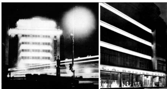
Fig. 2: Ely J. Kahn, Zimmermann Saxe and Zimmerman Associated, New York, 1919 (left), Erich Mendelsohn, C. A. Herpich Sons, Furriers, Berlin, view by night (right)

These new photographs mark the passages between the different picture series and interrupt rhythmically the visual narration with sudden images of the metropolitan chaos. Thus it clarifies, the problems Mendelsohn tried to describe. His substantial goal was not a realistic representation of the urban space, but the representation of the urban growth phenomena, which manifest themselves in the modern metropolis. The material instrument, i. e. the photography as optical representation of the eye-view, remains. The type of visual arrangement as expressing language is only a temporary mean and may be changed and/or revised. Exactly in these years there was a strong change in the language of the modern photography in Germany, also by the influence of photobooks like Amerika or Malerei Photographie Film . The new additional pictures are photographs by Mendelsohn's chief architect Erich Karweik, which travelled 1927 to New York. These pictures are partially influenced by the photographic style of the 'New Vision'.