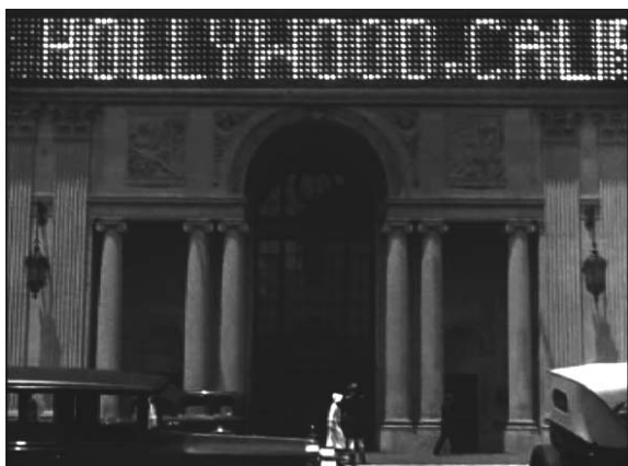
Fig. 1: Continuity editing: filmstill from Footlight Parade

The first long-shot of the film Footlight Parade (1933, fig. 1) shows the lower part of the Times Square tower where illuminated letters announce that sound films (talkies) will replace silent films. The following shot shows a close up of Chester Kent (James Cagney) who comments "what a laugh". Thus we get the impression that Kent is commenting on what we have just seen. The cut from long shot to the close up of Kent establishes the theme of the film and introduces the protagonist Chester Kent, whose actions the camera will follow in the following sequence. A close up shows an office door with the sign "Al Frazer and Si Gould Productions." Next we see Kent coming up a staircase, entering through the door we have already seen before, and we watch him talking to two men, probably Frazer and Gould in the office, discussing the situation of entertainment. Kent is being told that he is out of job because people 'ain't paying for shows any more'. In order to show him why he