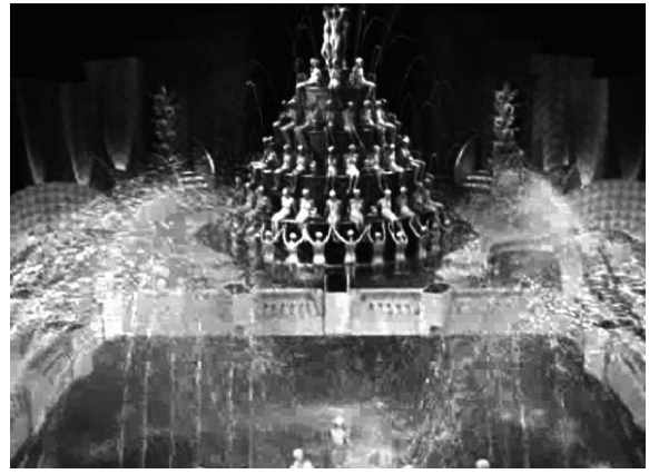
Fig. 3: Filmstill from Footlight Parade : musical number "By the Waterfall"

where his knowledge about space is of no use (fig. 2, 3).