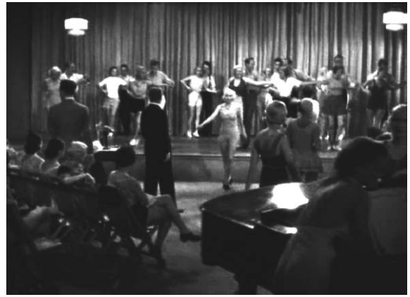
Fig. 5: Filmstill from Footlight Parade : backstage scene

he goes through the door (fig. 4, 5). This creates the impression that these rooms are part of the stage scenery without the fourth wall. Within the backstage plot this effect is generally avoided. Thus the spectator is irritated. Is this stage or backstage? Obviously it is backstage, but it is presented as stage. The camera moves parallel to the scene. This could convey the impression that the rooms are lined up as on a conveyor belt. The next shot, which shows the rehearsal from Kent's perspective returns to the principle of continuity editing .