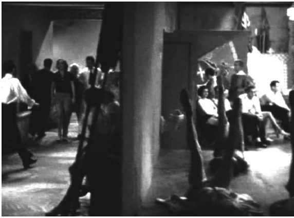
Fig. 4: Filmstill from Footlight Parade : backstage scene