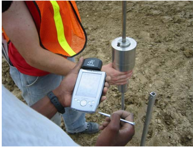
Figure 3. G-RAD Collecting Dynamic Cone Penetrometer Data