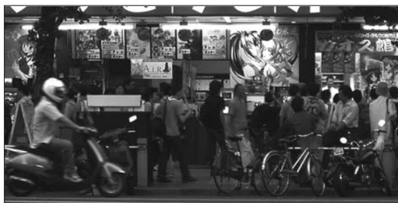
Fig. 2: Otaku icons

Otakus were, by nature, once-ambitious boys, who were particularly affected by the loss of faith in science and technology. They used to adore science, and technology, but when America had to shift their resoures from space exploration to the Vietnam War, and scientific future abruptly started to fade, their worship shifted from science to