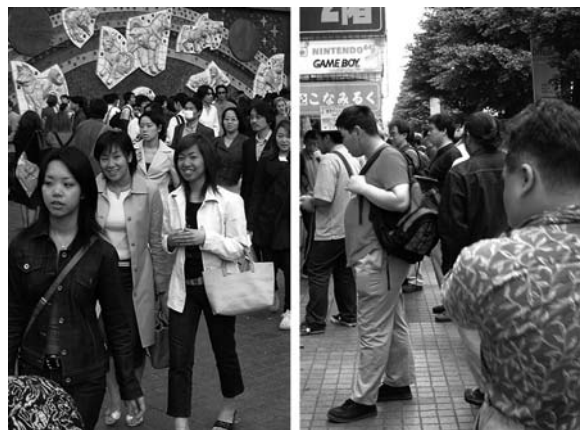
Fig. 5: Shibuya people (left) and Akihabara equivalent